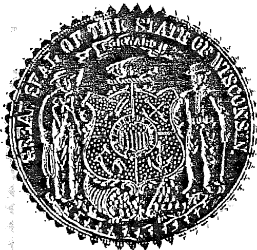
Anthony S. Earl, Governor

Handwritten signature of Anthony S. Earl in cursive script.