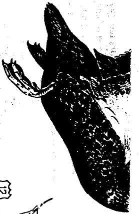
light brown to orange-red large size length 21 to 25 inches weight 2 to 3 pounds.