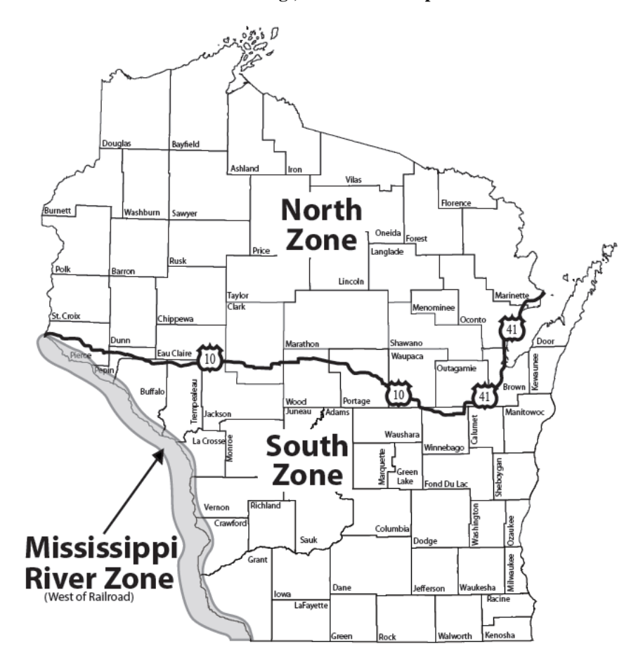
Section 3 (first alternative version to consider at hearings). NR 10.32 is repealed and recreated:

SECTION 3 (second alternative version to consider at hearings). NR 10.32 is repealed and recreated to read: