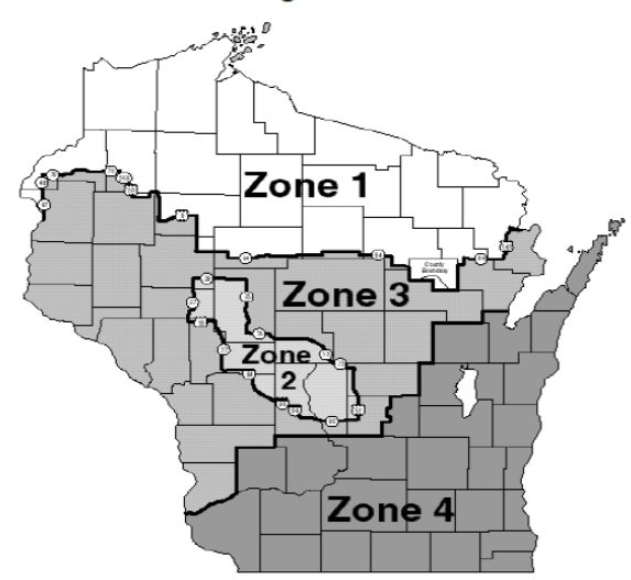
NR 10.20 Wolf management zones.

Coyotes are commonly harvested incidentally by people who are primarily hunting deer during the firearm deer season. Expanding that opportunity to hunters in Wolf Management Zone 1 will increase opportunity for those hunters and they are the only people who are likely to be affected by the proposed rule.