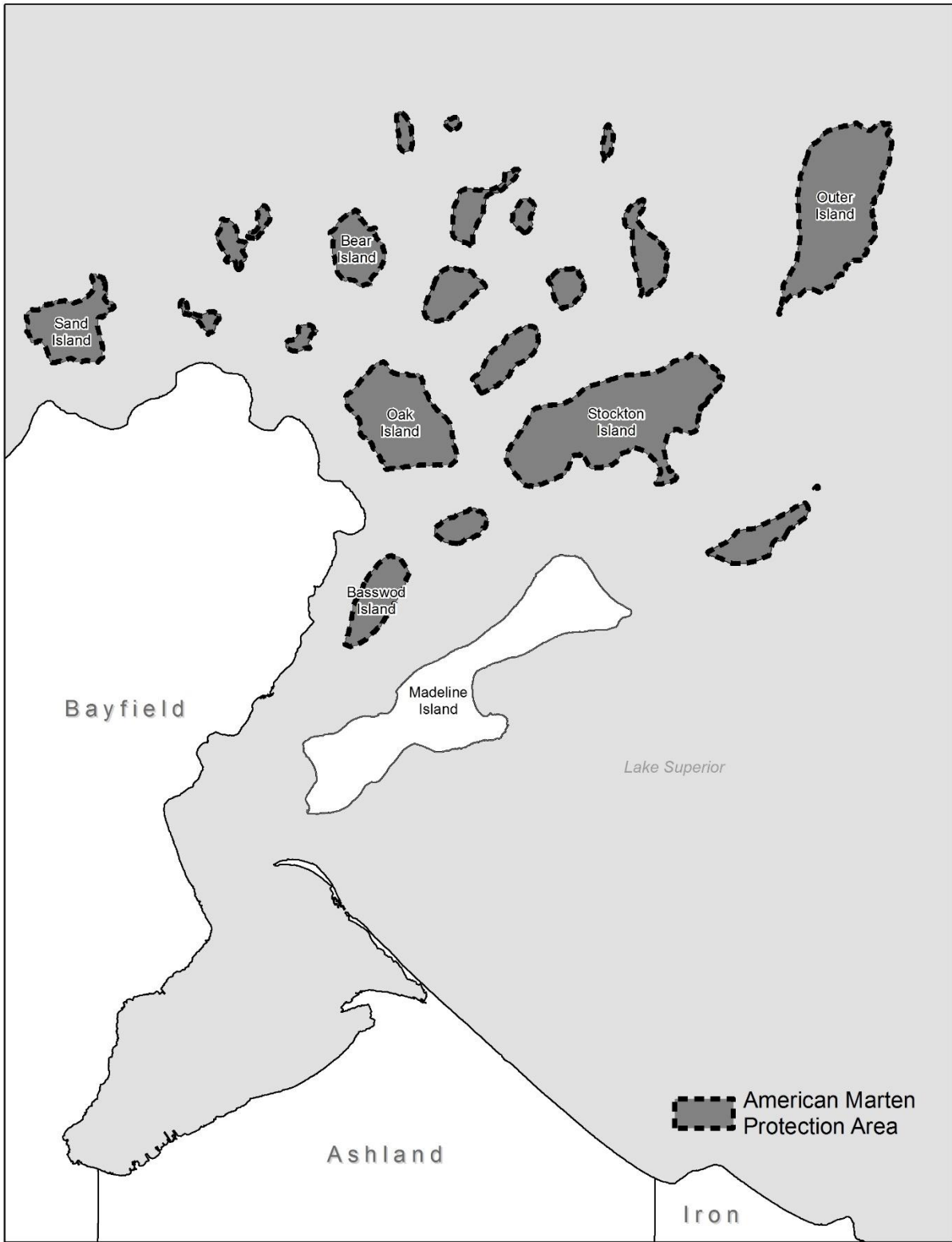
(c) Pine River Area (Forest, Oneida, and Vilas Counties)