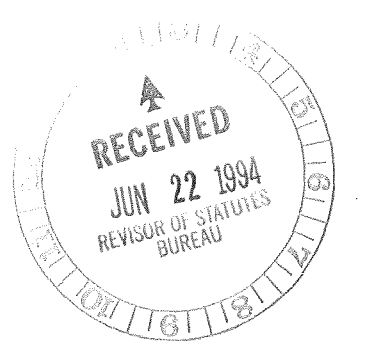
Medical Examining Board