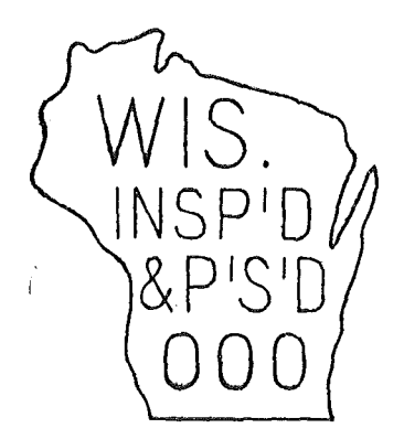
Register, September, 1972, No. 201

Ag 47.10 Inspection marks and establishment numbers. (1) ESTABLISHMENT NUMBER. An official number shall be assigned to each establishment where continuous state meat inspection is conducted. Such numbers shall be used to identify all meat and meat products