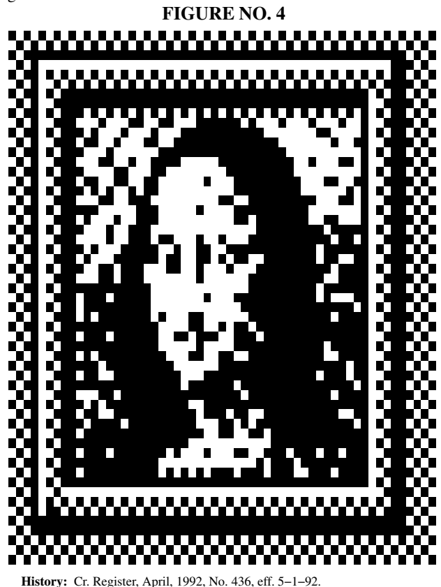
Insury: CI. Register, April, 1992, 100. 450, Cli. 5–1–92.

(3) Hoses may not be contaminated by contact with the ground.