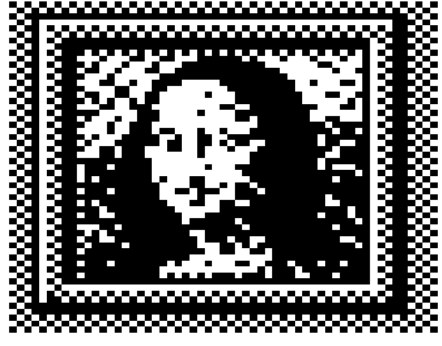
History: Cr. Register, April, 1992, No. 436, eff. 5-1-92.

NR 811.68 Separation of water mains and other contamination sources. (1) Proposed water mains shall be adequately separated from any potential source of contamination. The following minimum horizontal separation distances shall be maintained: