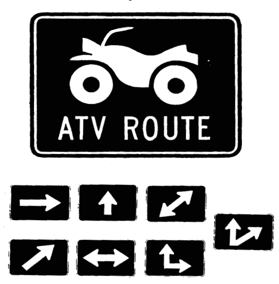
ALL TERRAIN VEHICLE ROUTE SIGN AND ARROWS (M-7 SERIES)