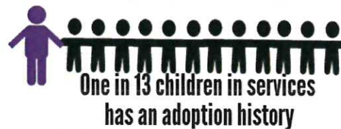
Based on WAFCA Survey 10/14

Agencies were asked to identify the number of children in their programs with a known adoption history. While a few agencies responded that they did not track this information, respondents identified 134 children in their programs who were adopted. Given the 1805 children in services identified in the sample this means one in thirteen children in services was adopted.