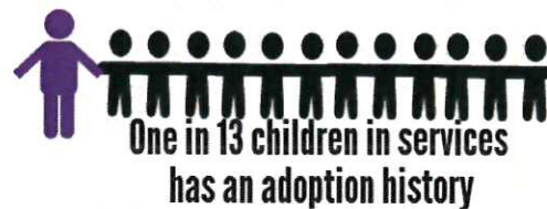
Based on WAFCA Survey 10/14

Agencies were asked to identify the number of children in their programs with a known adoption history. While a few agencies responded that they did not track this information, respondents identified 134 children in their programs who were adopted. Given the 1805 children in services identified in the sample this means one in thirteen children in services was adopted.