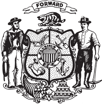
The Coat of Arms

Over the years the Wisconsin Legislature has officially recognized a wide variety of state symbols. In order of adoption, Wisconsin has designated an official seal, coat of arms, motto, flag, song, flower, bird, tree, fish, state animal, wildlife animal, domestic animal, mineral, rock, symbol of peace, insect, soil, fossil, dog, beverage, grain, dance, ballad, waltz, and fruit. (The “Badger State” nickname, however, remains unofficial.) These symbols provide a focus for expanding public awareness of Wisconsin’s history and diversity.