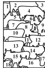
Back Cover Cows: