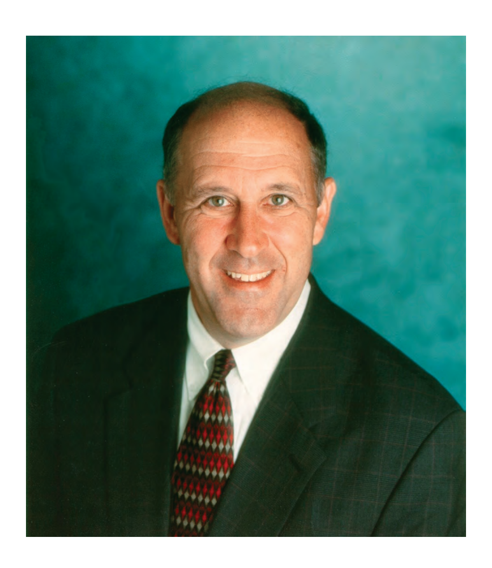
Governor JIM DOYLE