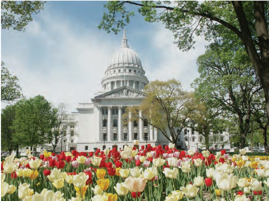
The blooming tulips ringing the Capitol Square are one of the surest signs that spring has arrived in Madison.

Sources: 2005-2006 Wisconsin Statutes; Wisconsin Legislative Reference Bureau, Wisconsin Brief 06-17, Salaries of State Elected Officials , December 2006.