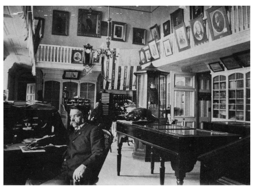
(Wisconsin Veterans Museum)