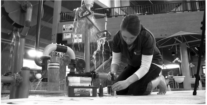
(top) An entomologist with the Department of Agriculture, Trade and Consumer Protection checks a trap for agricultural pests as part of the department's growing season survey that helps farmers with pest control. (above) An inspector for the Division of Food and Recreational Safety tests water samples to be sure a water park is safe.

and is administered by a secretary. The members of the board and the secretary are appointed by the governor with the advice and consent of the senate.