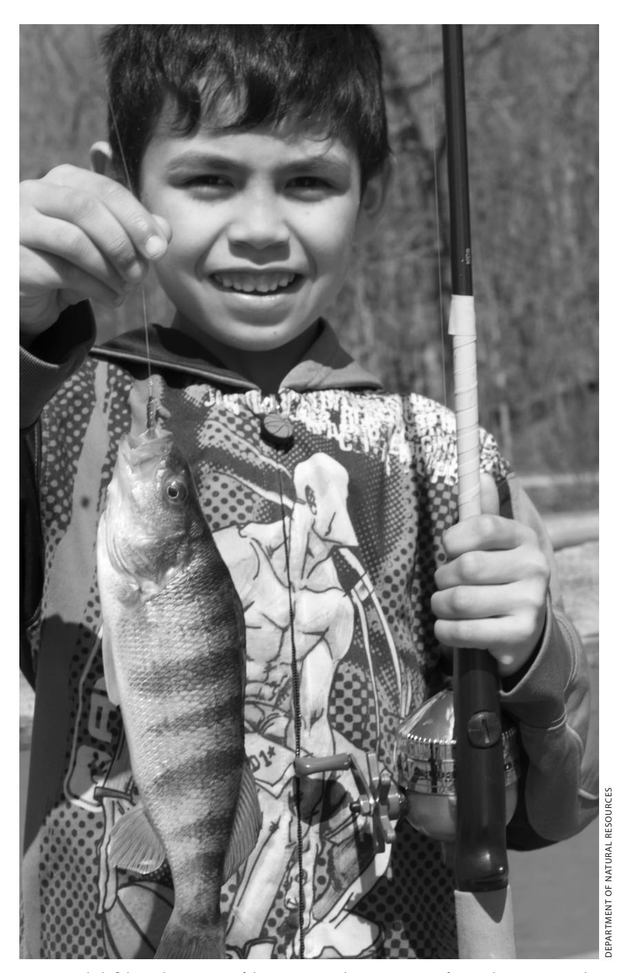
Putting on kids fishing clinics is one of the many ways the Department of Natural Resources works with local organizations to build an appreciation for the state's natural resources.