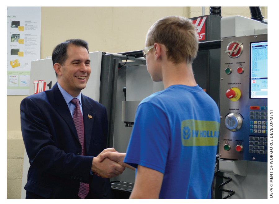
Governor Walker visits Beloit High School to meet with students participating in the Department of Workforce Development's Youth Apprenticeship Program.

various alcohol and drug abuse programs among state agencies. The council also reviews and provides an opinion to the legislature on proposed legislation that relates to alcohol and other drug abuse policies, programs, or services.