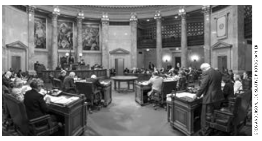
There are 33 members of the state senate, and they are elected for four-year terms.