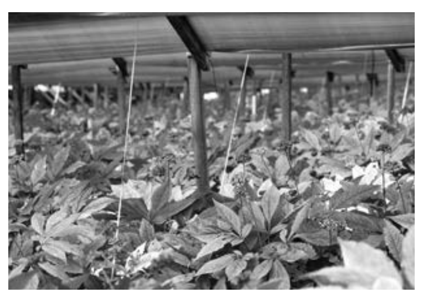
Ginseng, Wisconsin's state herb, has been cultivated in Wisconsin for over a century. It is estimated that in 2017 Wisconsin farmers produced approximately 10 percent of the world's supply of ginseng.