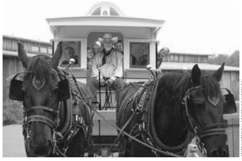
The Wisconsin State Historical Society is an executive branch agency that preserves historical and cultural resources such as the Wade House historic site, a stagecoach inn from the 1850s. Above, visitors enjoy a ride in an omnibus.