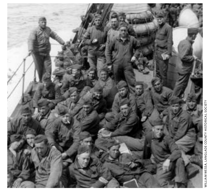
After an armistice ended World War I, many letters from soldiers expressed impatience to return home. Even though the armistice was signed in November 1918, many servicemen did not leave France until late April or early May 1919.