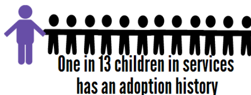
Based on WAFCA Survey 10/14

Agencies were asked to identify the number of children in their programs with a known adoption history. While a few agencies responded that they did not track this information, respondents identified 134 children in their programs who were adopted. Given the 1805 children in services identified in the sample this means one in thirteen children in services was adopted.