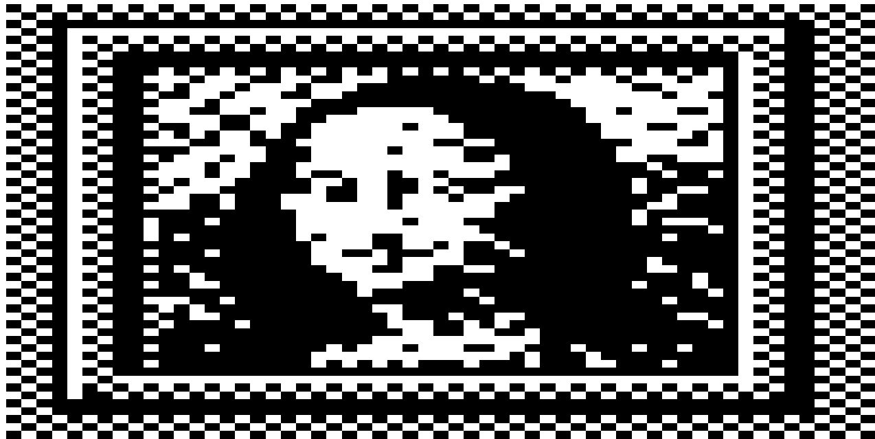
Figure 34.23 SYSTEMS OF BLOCKS

History: Cr. Register, February, 1992, No. 434, eff. 3-1-92; CR 01-139: am. (2) (a) Register June 2002 No. 558, eff. 7-1-02; CR 02-127: am. (1), (2) (a), (b) and (4) Register May 2003 No. 569, eff. 6-1-03; correction in (2) (a) made under s. 13.92 (4) (b) 7., Stats., Register February 2008 No. 626; CR 08-054: renun. (1) and (2) (a) to be (1) (a) and (2), cr. (1) (b), r. (2) (b) and (c), r. and recr. (4) Register December 2008 No. 636, eff. 1-1-09.