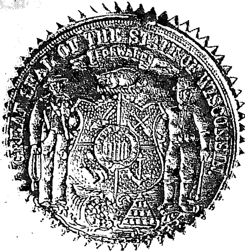
Anthony S. Earl, Governor