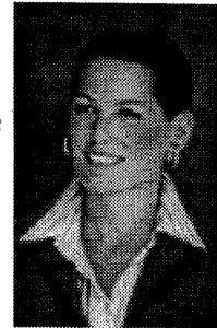
Susan G. Komen's Story

To eradicate breast cancer as a life-threatening disease by advancing research, education, screening and treatment.