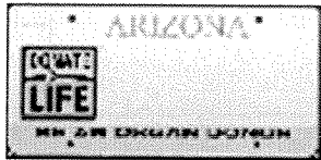
AZ Donor Plate.gif