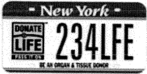
New York Donor Plate (2).gif