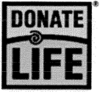
DonateLife Logo RGB.gif