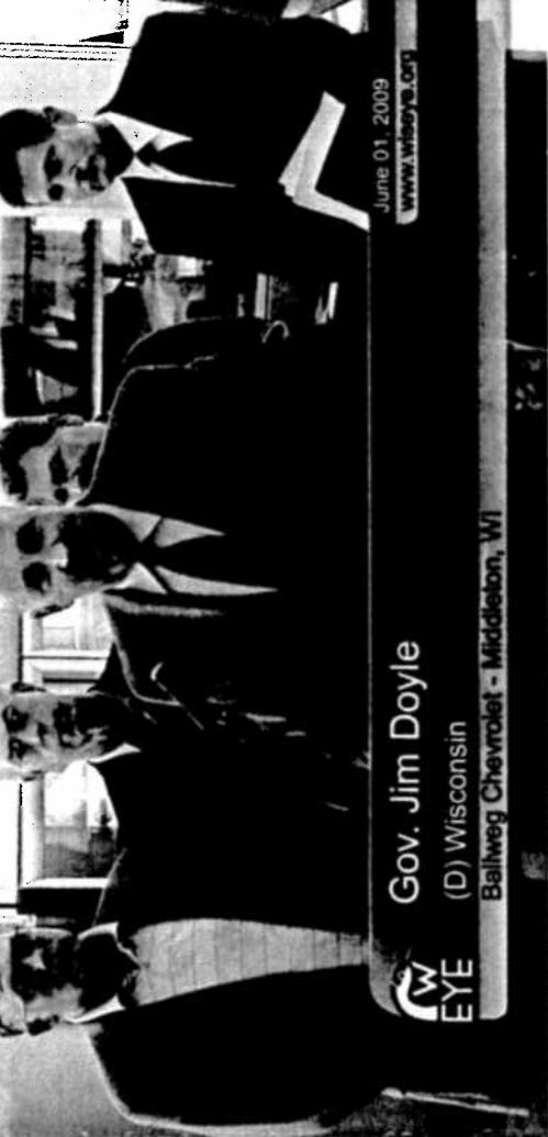
Gov. Jim Doyle (D) Wisconsin Ballweg Chevrolet - Middleton, WI