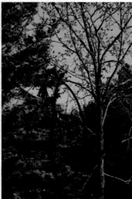
Turbine #6- 3/4 mile away