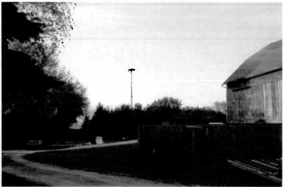
Turbine #4 from foundation of house. Turbine #4 30' from house. This turbine is 1560 feet away from house