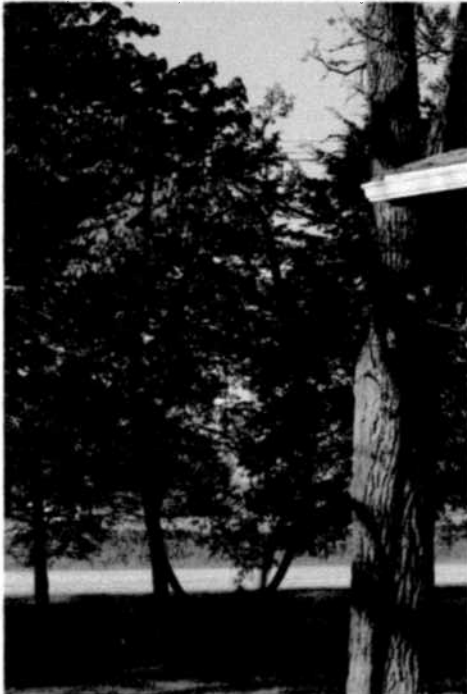
Turbine #73 2480' away