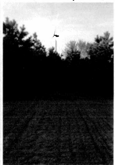
Turbine #4 from my garden

You can see by these photos that my house is protected by trees yet I receive a tremendous amount of sound from 5 different turbines. I feel sad for the home owners that have no trees to help suppress the sound. Why would any person, company or government agency turn their heads away to do this to any other person, family or group is beyond my comprehension.