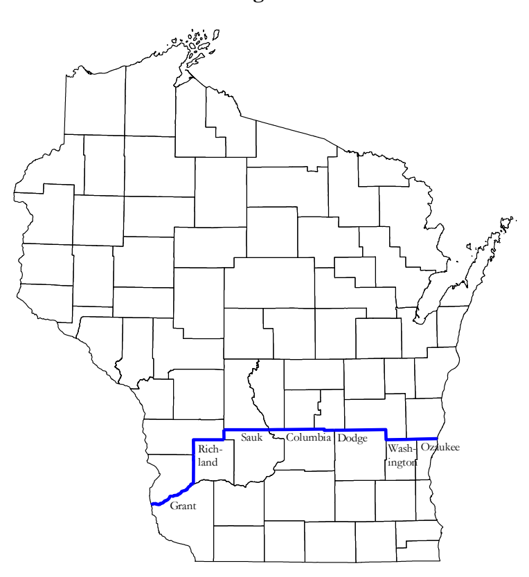
Figure 62.16–2 Alternate 4% g Contour Location

Comm 62.1621 Component certification. The requirements in IBC section 1621.3.5 are not included as part of this code.