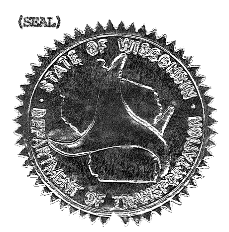
Division of Motor Vehicles Wisconsin Department of Transportation