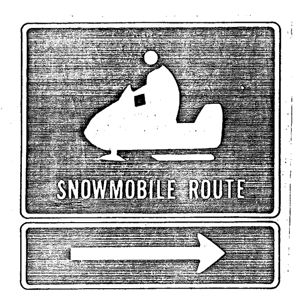
GREEN-REFLECTORIZED BACKGROUND WITH WHITEREFLECTORIZED LETTERS AND SYMBOLS