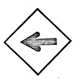
DIRECTIONAL ARROW SIGN

Color: Reflective yellow background and black letters or legend.