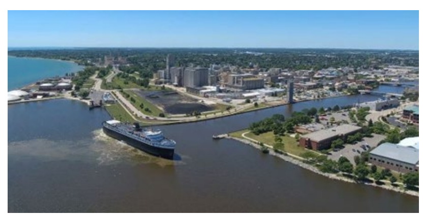
From Bridget VanGinkle's drone video footage of the SS Badger entering Manitowoc Harbor.

Witnessing the SS Badger power past the Breakwater Lighthouse as it slips into Manitowoc Harbor on a warm summer day is an awe-inspiring sight.