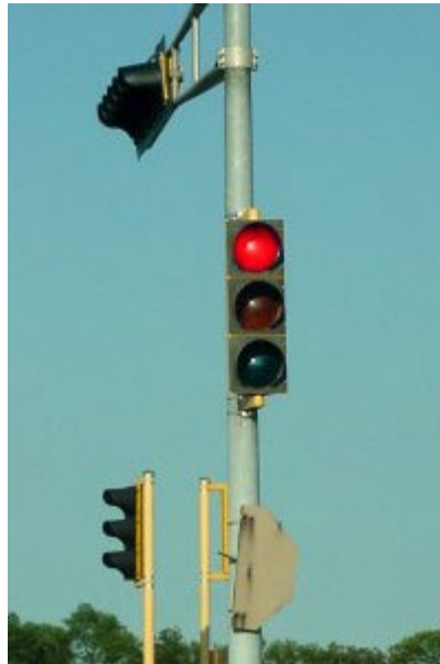
Running a red light is no joke

The law is clear on how you must behave at traffic signals: