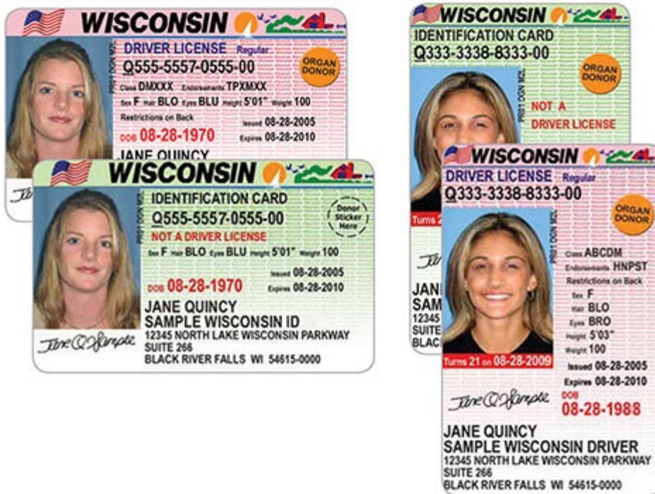
Sample cards issued September 2005 to 2012