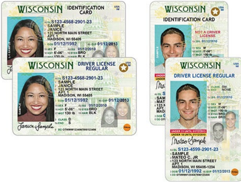
Sample cards issued March 2012 to October 2015