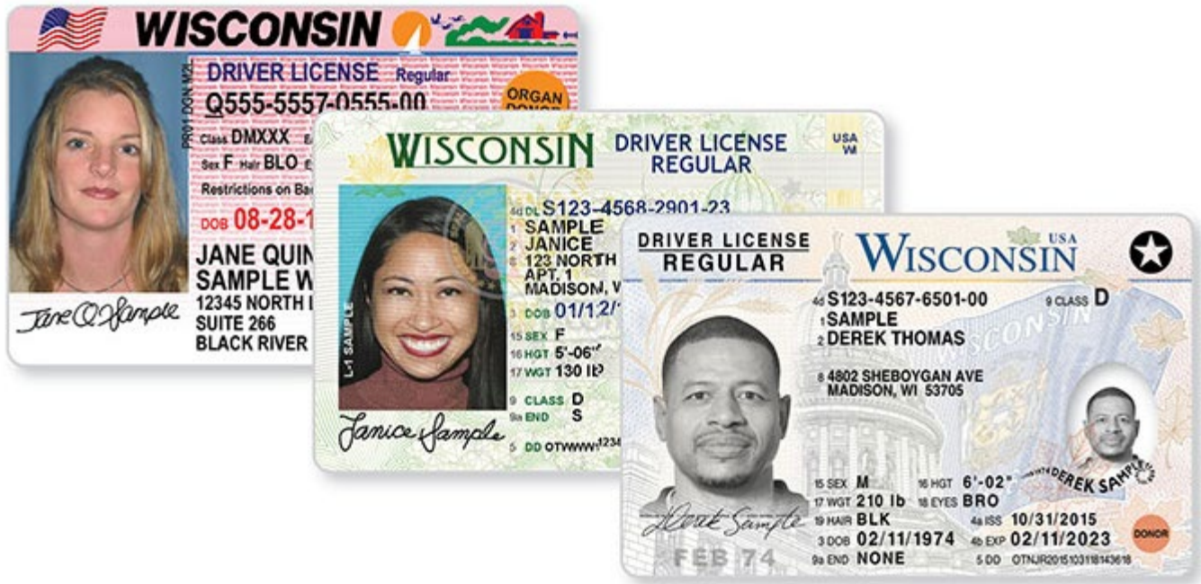
Three sample cards currently in circulation