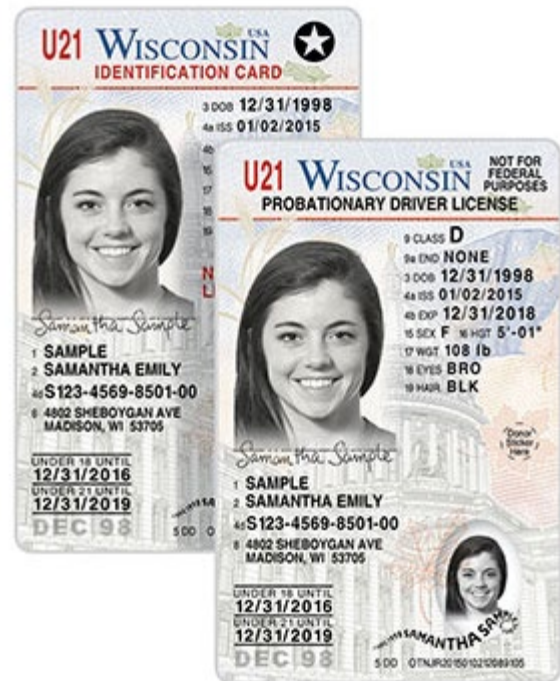
Sample under 21 cards starting Fall 2015