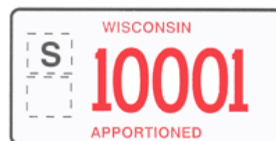
Apportioned license plate

Cab-cards now show all jurisdictions! No more "add state or province." No more "over 100 percent fees" for added jurisdictions. If you have IRP, no more trip permits. This is true IRP-wide. All states and provinces have implemented this. Learn more about full reciprocity.