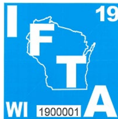
2019 IFTA sticker

The IFTA license offers several benefits to the interstate/inter-jurisdictional motor carrier. These benefits include one license, one set of decals per vehicle, and one quarterly fuel tax report per licensee that reflects the net tax or refund due. These advantages result in cost and time savings for the carrier and the member jurisdictions.