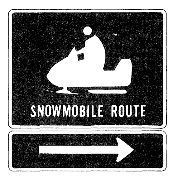
GREEN-REFLECTORIZED BACKGROUND WITH WHITE-REFLECTORIZED LETTERS AND SYMBOLS