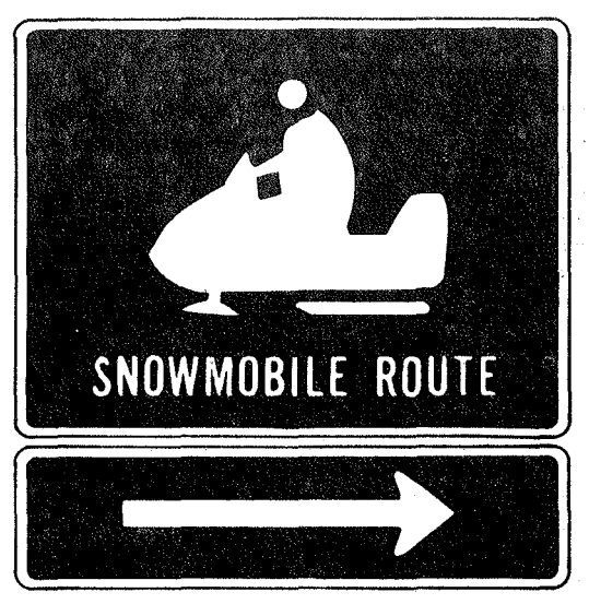
GREEN-REFLECTORIZED BACKGROUND WITH WHITE-REFLECTORIZED LETTERS AND SYMBOLS