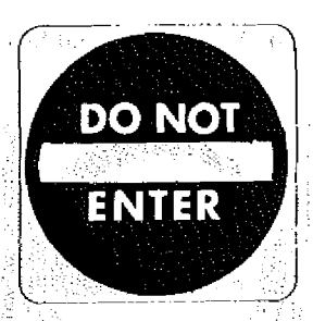
DO NOT ENTER SIGN

Purpose: To indicate one-way trail or restricted area.