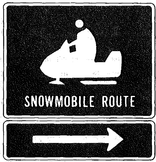
GREEN-REFLECTORIZED BACKGROUND WITH WHITE-REFLECTORIZED LETTERS AND SYMBOLS