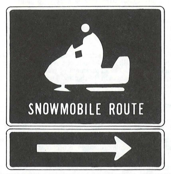
GREEN-REFLECTORIZED BACKGROUND WITH WHITE-REFLECTORIZED LETTERS AND SYMBOLS