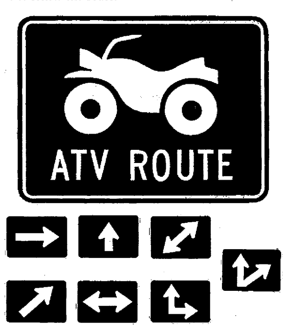
ALL TERRAIN VEHICLE ROUTE SIGN AND ARROWS (M-7 SERIES)

GREEN REFLECTORIZED BACKGROUND WITH WHITE REFLECTORIZED LETTERS, SYMBOLS, AND BORDER