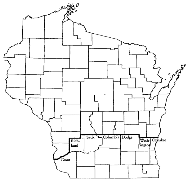
Figure 62.16–2 Alternate 4% g Contour Location

History: CR 00-179: cr. Register December 2001 No. 552, eff. 7-1-02.