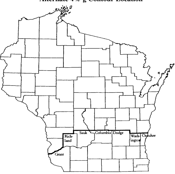
History: CR 00-179: cr. Register December 2001 No. 552, eff. 7-1-02.

Comm 62.1621 Component certification. The requirements in IBC section 1621.3.5 are not included as part of this code.