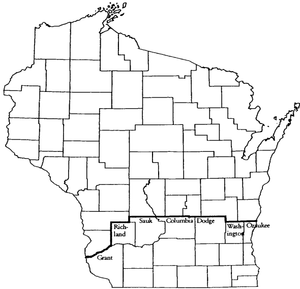
Figure 62.16-2 Alternate 4% g Contour Location

History: CR 00-179: cr. Register December 2001 No. 552, eff. 7-1-02.