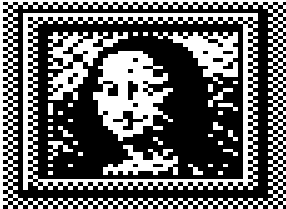
Figure 34.23 SYSTEMS OF BLOCKS

History: Cr. Register, February, 1992, No. 434, eff. 3-1-92; CR 01-139: am. (2) (a) Register June 2002 No. 558, eff. 7-1-02; CR 02-127: am. (1), (2) (a), (b) and (4) Register May 2003 No. 569, eff. 6-1-03.