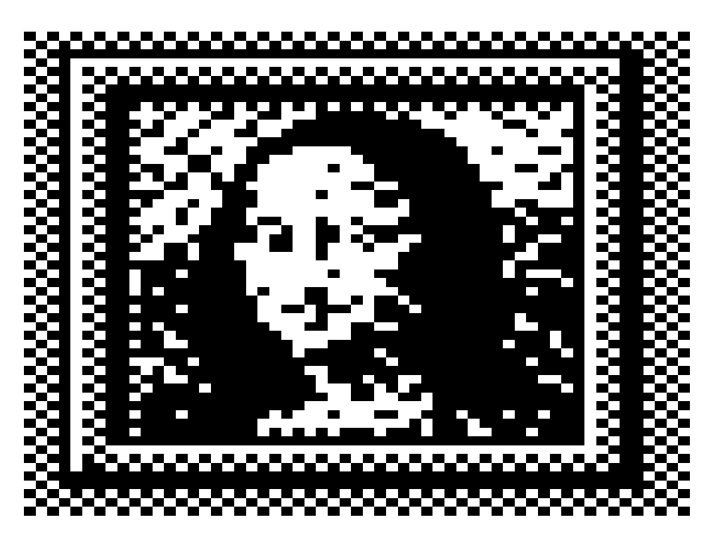
Figure 34.23 SYSTEMS OF BLOCKS

History: Cr. Register, February, 1992, No. 434, eff. 3–1–92; CR 01–139: am. (2) (a) Register June 2002 No. 558, eff. 7–1–02; CR 02–127: am. (1), (2) (a), (b) and (4) Register May 2003 No. 569, eff. 6–1–03.