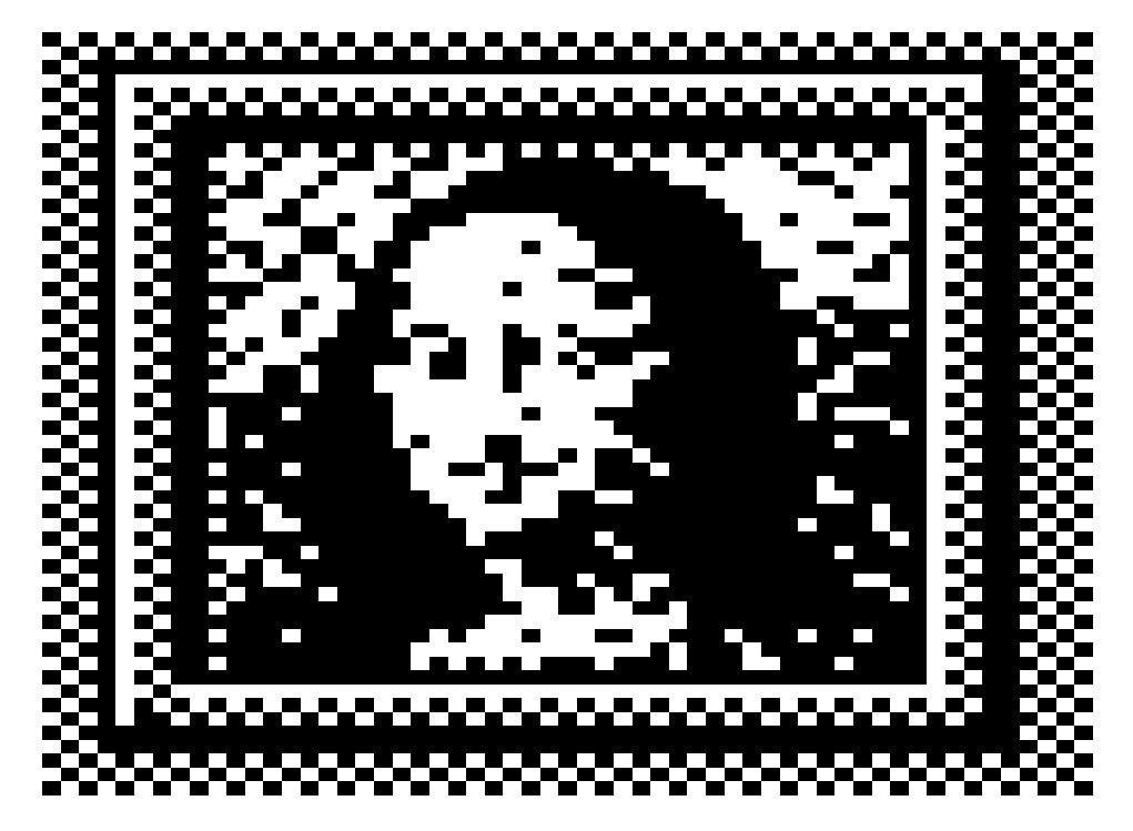
Figure 34.23 SYSTEMS OF BLOCKS

History: Cr. Register, February, 1992, No. 434, eff. 3–1–92; CR 01–139: am. (2) (a) Register June 2002 No. 558, eff. 7–1–02; CR 02–127: am. (1), (2) (a), (b) and (4) Register May 2003 No. 569, eff. 6–1–03; correction in (2) (a) made under s. 13.92 (4) (b) 7., Stats., Register February 2008 No. 626.