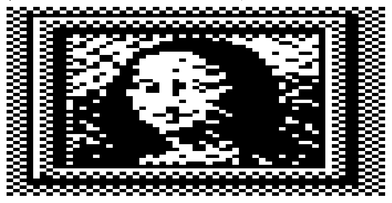
Figure 34.23 SYSTEMS OF BLOCKS

History: Cr. Register, February, 1992, No. 434, eff. 3–1–92; CR 01–139; am. (2) (a) Register June 2002 No. 558, eff. 7–1–02; CR 02–127; am. (1), (2) (a), (b) and (4) Register May 2003 No. 569, eff. 6–1–03; correction in (2) (a) made under s. 13.92 (4) (b) 7., Stats., Register February 2008 No. 626; CR 08–054; renum. (1) and (2) (a) to be (1) (a) and (2), cr. (1) (b), r. (2) (b) and (c), r. and recr. (4) Register December 2008 No. 636, eff. 1–1–09.