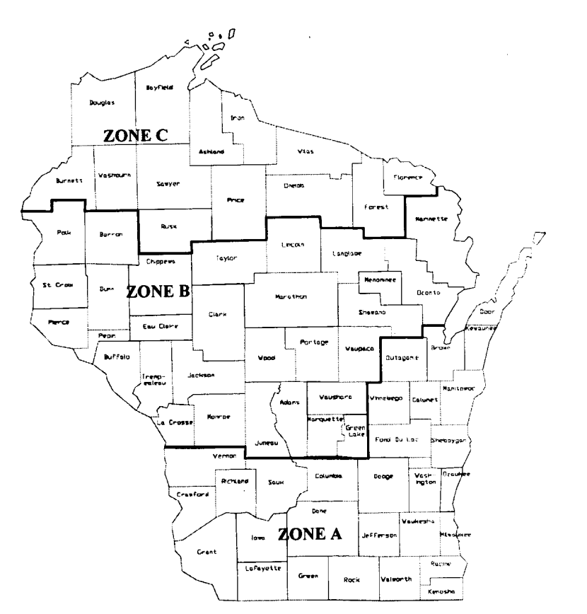
Figure 85.60-2 Latest Date to Begin Spring Soil Saturation Monitoring