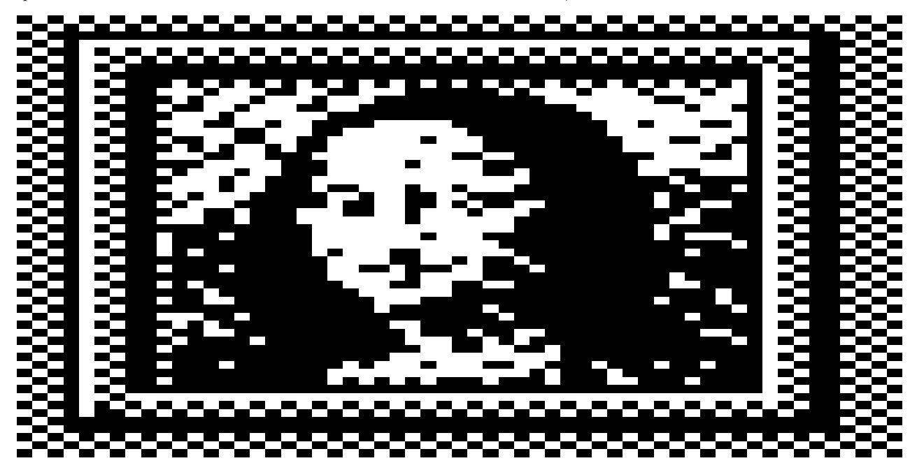
Figure 34.23 SYSTEMS OF BLOCKS

History: Cr. Register, February, 1992, No. 434, eff. 3–1–92; CR 01–139: am. (2) (a) Register June 2002 No. 558, eff. 7–1–02; CR 02–127: am. (1), (2) (a), (b) and (4) Register May 2003 No. 569, eff. 6–1–03; correction in (2) (a) made under s. 13.92 (4) (b) 7., Stats., Register February 2008 No. 626; CR 08–054: renum. (1) and (2) (a) to be (1) (a) and (2), cr. (1) (b), r. (2) (b) and (c), r. and recr. (4) Register December 2008 No. 636, eff. 1–1–09.