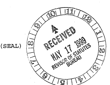
STATE OF WISCONSIN DEPARTMENT OF NATURAL RESOURCES