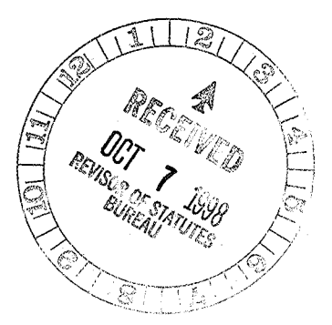
Chairperson Controlled Substances Board