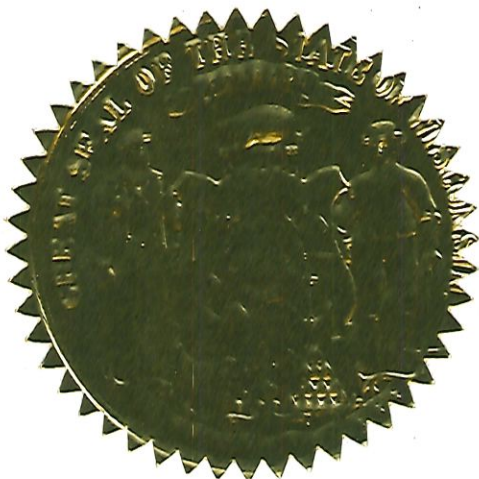
TONY EVERS Governor

IN TESTIMONY WHEREOF, I have hereunto set my hand and caused the Great seal of the State of Wisconsin to be affixed. Done at the Executive Residence in the Village of Maple Bluff this nineteenth day of January in the year of two thousand twenty-one.